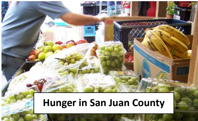
Hunger in San Juan County